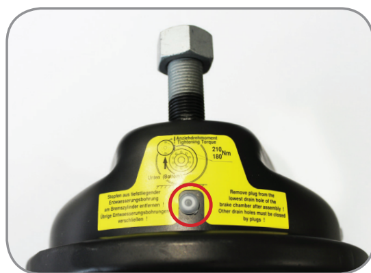
The plug still in place.

Two plugs need to be removed. The plugs to be removed will depend on the orientation of the booster. It is always the lower plugs that need to be removed.