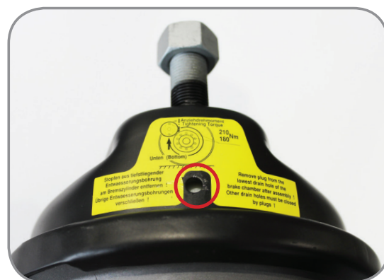
The plug removed.