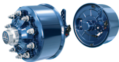
Axle stub for double-decker and inloader vehicles