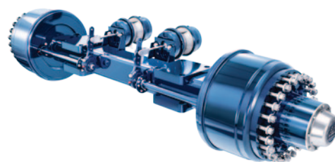
Heavy-duty axles for ultra-heavy transport items