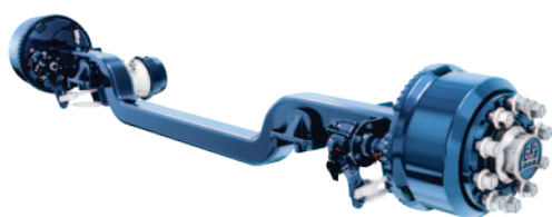
Cranked axles for car and boat transporters

RTS-RIECERTEAM.DE BPW-Flyer-Spezialachsen 15651301e