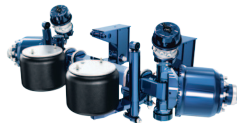
Steering axles for special vehicles with special dimensions and/or multi-axes