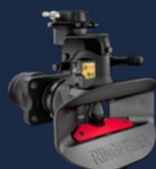
RF50 AM AUS 15990614