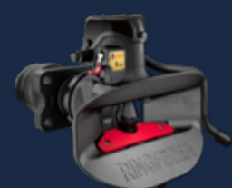
RF50 B AUS MSD 15990579

The new funnel design has a reinforced lip and is quicker and easier to replace.