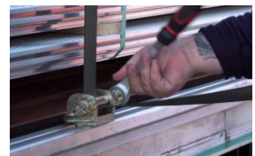
Ratchet for Netcap aluminium rail