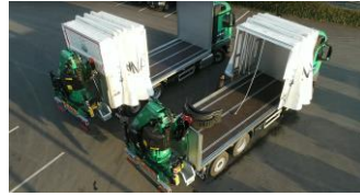
Belgium [truck + trailer with crane for glass]