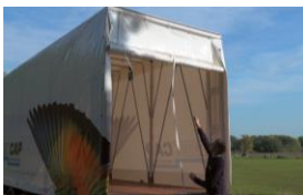
Spring loaded roll up