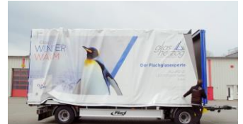
Germany [trailer with rear doors, for glass transport]