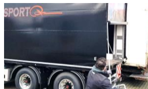
Wind-up sheet with crank handle