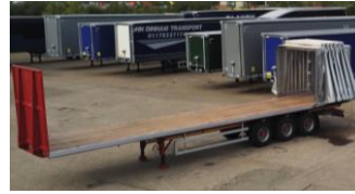
UK [Semi-trailer for general purpose]