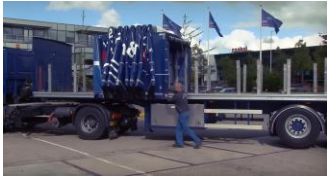
General Netcap movie with voice-over