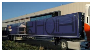
Netherlands [teletrailer with double rail, for 21m steel]