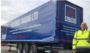
UK [Semi-trailer for general purpose]