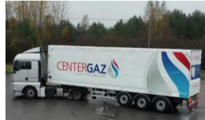
Poland [Short semi-trailer]