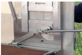
Overcentre lockings in front or rear trolley