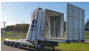
Netherlands [stepdeck semi-trailer for machines]