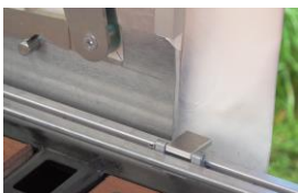
Trolley stoppers, to prevent the system to roll close