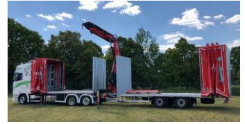
Czech Republic [truck + trailer with crane for glass transport]