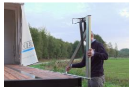
Triangle shaped post with ratchet and strap