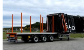
Austria [Semi-trailer for wood, with double lifting bows]