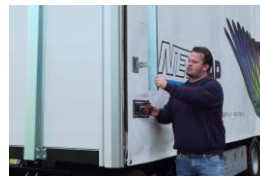
Quicklocks integrated in trolley