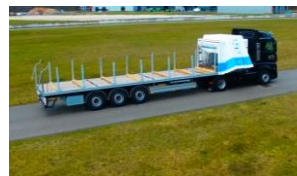
Netherlands [semi-trailer for steel]