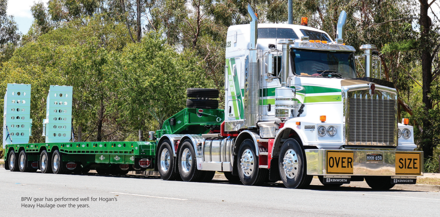
BPW gear has performed well for Hogan's Heavy Haulage over the years.