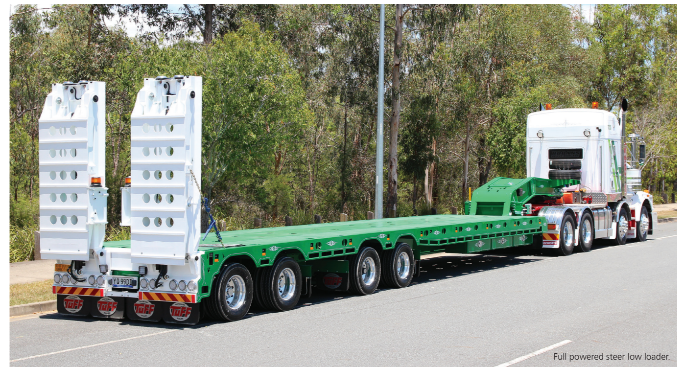
Full powered steer low loader.

BPW Transpec Pty Ltd 1-11 Cherry Lane Laverton North VIC 3026 Ph: (03) 9267 2434 Web: www.bpwtranspec.com.au