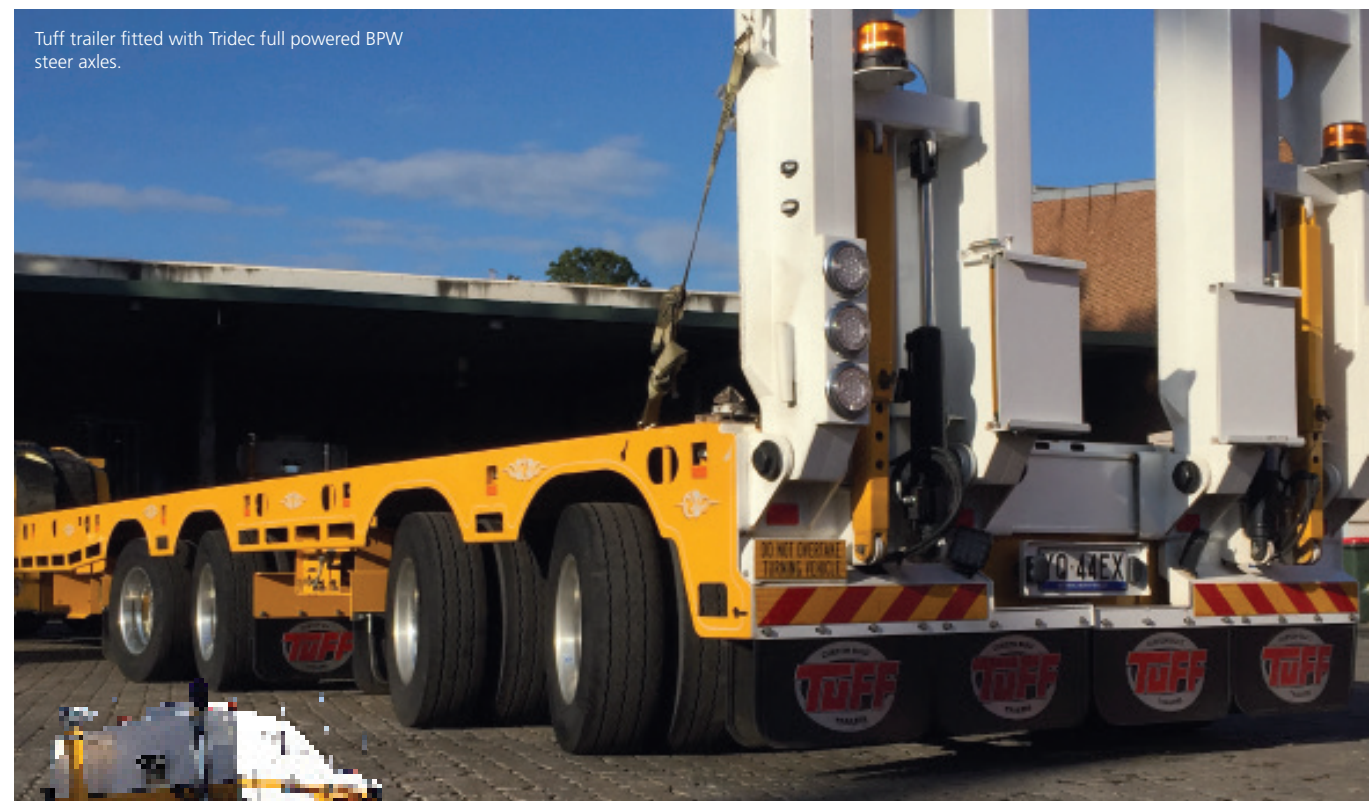
Tuff trailer fitted with Tridec full powered BPW steer axles.

Tom describes the ability of the new trailer to be backed into tight access as 'phenomenal' — adding that it has made the delivery of large gensets to an Australian Defence Force site in Canberra much less stressful for the driver. "It's more