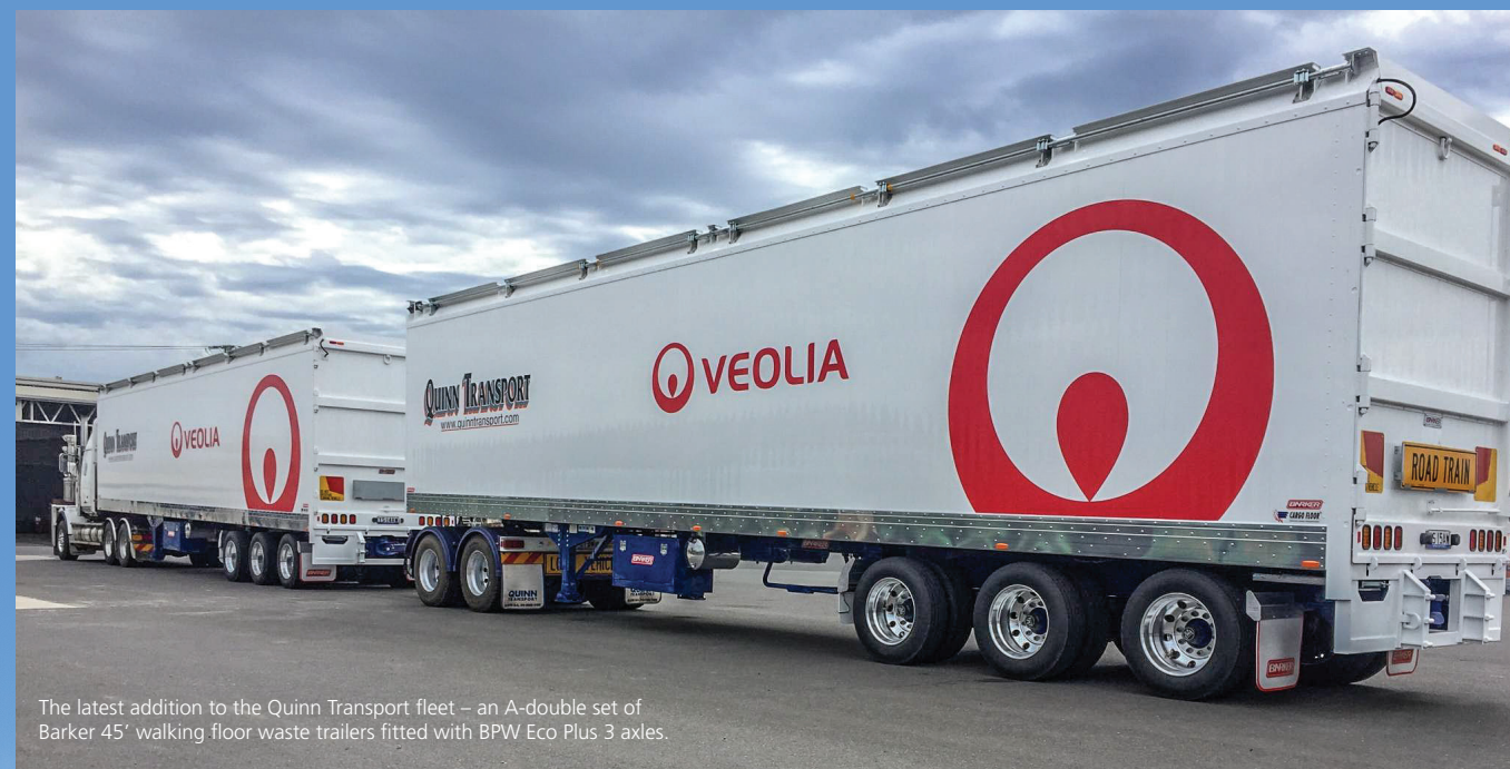
The latest addition to the Quinn Transport fleet – an A-double set of Barker 45’ walking floor waste trailers fitted with BPW Eco Plus 3 axles.

“If we do buy new trailers, we’ll spec BPW. The oldest set we have is on a Freightmaster flattop that my father bought new in 1997 and it hasn’t missed a beat. Our fleet is probably over 50 per cent BPW now, with the others being a mix of everything depending on what the second-hand trailers had fitted at the time.”